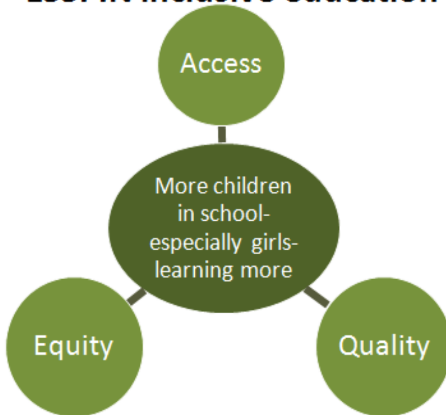
Figure 1: ESSPIN Inclusive Education goal chart